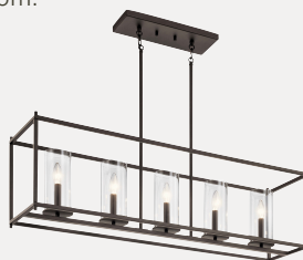
Linear Chandelier 43995OZ