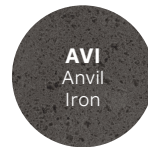
AVI Anvil Iron