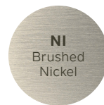
NI Brushed Nickel