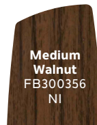
Medium Walnut FB300356 NI