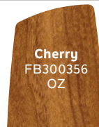
Cherry FB300356 OZ