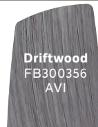
Driftwood FB300356 AVI