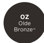
OZ Olde Bronze™